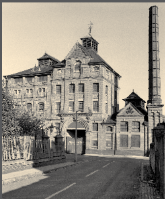
Images from top to bottom: Strelley House*, The ruins of Bulwell Hall stables with ST Cooper's initials, Basford House*, The Prince of Wales Brewery*