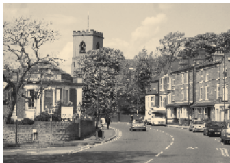
Old Bulwell library and St Mary's Church

Standards of living in the nineteenth century was a tale of two halves. Since the Napoleonic Wars there had been a slump in the hosiery trade, and framework knitters, undercut by rising rents and low skilled labour, took to smashing their masters' machinery. The response from the authorities was less than helpful – a workhouse was built in 1815. Nothing survives of the actual building apart from a perimeter wall (26) but it is still enough to give the impression of a prison for the unemployed. For a time the working class could not find much solace in the established church, building their own “nonconformist” chapels scattered throughout the Leen Valley (27) – the earliest on Handel St is dated 1811 (28).