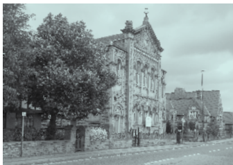
A Bulwell Stone former chapel, Main St

Standards of living in the nineteenth century was a tale of two halves. Since the Napoleonic Wars there had been a slump in the hosiery trade, and framework knitters, undercut by rising rents and low skilled labour, took to smashing their masters' machinery. The response from the authorities was less than helpful – a workhouse was built in 1815. Nothing survives of the actual building apart from a perimeter wall (26) but it is still enough to give the impression of a prison for the unemployed. For a time the working class could not find much solace in the established church, building their own “nonconformist” chapels scattered throughout the Leen Valley (27) – the earliest on Handel St is dated 1811 (28).