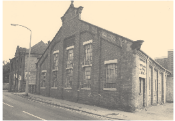
Pearson's bleachworks, beside the Leen*

The Midland Railway arrived in 1849 following the floodplain of the Leen, feeding not only on the commerce of the growing towns but also nearby coal mines. Thanks to the reopening of the 'Robin Hood Line' in 1993 and NET tram in 2004 this route survives today and you can still enjoy the restored Edwardian iron pedestrian bridge at David Lane (16). Yet these are only fragments of the numerous competing company lines which were mostly axed in the 1960s. Like some lost civilisation, curious earthworks and bits of blue engineering brick are scattered over the landscape, such as the Great Central route beside the Bulwell Forest Golf Course (17) and Great Northern embankments as viewed from Leonard Street (18). The Catchems Corner Pub (19) was so called because you could "catch 'em both ways"; take either the GNR train from the Bulwell & Basford Station at Park Lane, or the nearby trams. The tramways and Vernon Rd with its huge wall (20) were built in the 1880s. At first the early trams were pulled by horses and so this wall was required to shield them from the fright of passing steam engines.